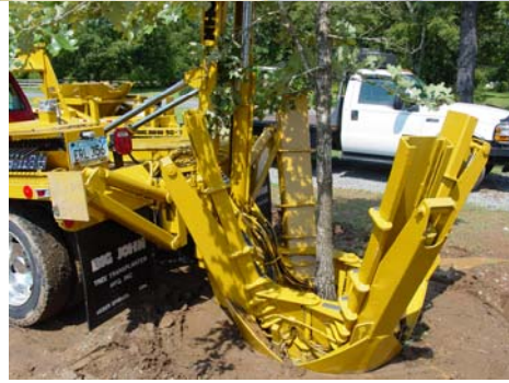
Model 45D in action digging a tree.

BIG JOHN Tree Transplanter, PO Box 960, Heber Springs, AR72543