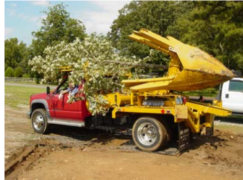
Ready to load into Pod Trailer