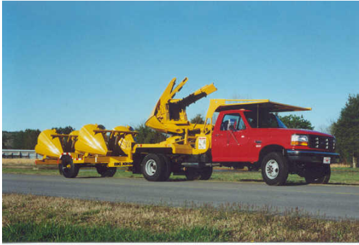
Model 45D Truck Mount

Are you looking for the most durable and functional machine of any size? Check out the Model 45D truck mount from BIG JOHN. Used by nurseries, landscapers and tree moving professional, the M45D gets the job done. Whether you're B&B'ing or what we call "Dig & Delivering", the appeal of the M45D is in its compact yet sturdy design and its array of allied components. The 4 or 8 pod trailers along with the freestanding pod make this unit extremely flexible.