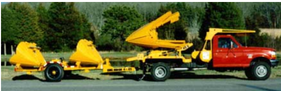
Ready to Move Trees! Machine Specification

Are you looking for the most durable and functional machine of any size? Check out the Model 45D truck mount from BIG JOHN. Used by nurseries, landscapers and tree moving professional, the M45D gets the job done. Whether you're B&B'ing or what we call "Dig & Delivering", the appeal of the M45D is in its compact yet sturdy design and its array of allied components. The 4 or 8 pod trailers along with the freestanding pod make this unit extremely flexible.