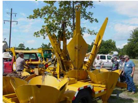
Time to go get another Tree!

The Model 45D is perfect for moving 3-4" caliper trees. It's fast, durable and with a pod trailer its ultra efficient. Give us a call to find out how you can increase your profits and performance with a Model 45 or any of the other sizes that BIG JOHN offers.